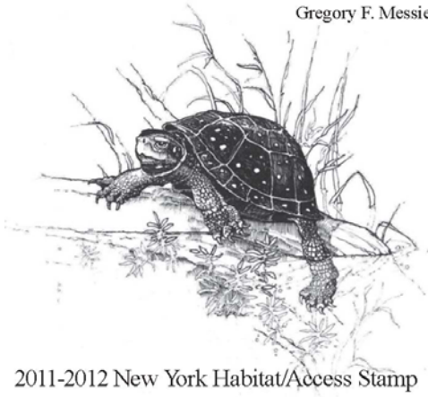
2011-2012 New York Habitat/Access Stamp

PRSRT STD US POSTAGE PAID ALBANY, NY PERMIT #598