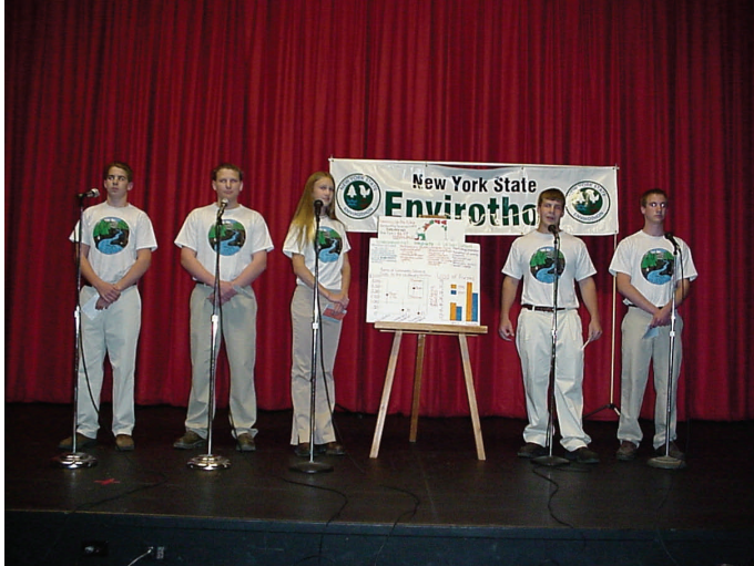
Weedsport High School team giving their oral presentation

Challenged by field professionals, students work as a team to explore the facets of the current environmental issues and illustrate the complexity of real-life environmental decisions.