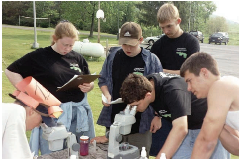
Team using microscopes to identify vertebrate

The program was designed to be a hands-on, outdoor competition for high school students that encourages an interest in natural resource conservation and environmental